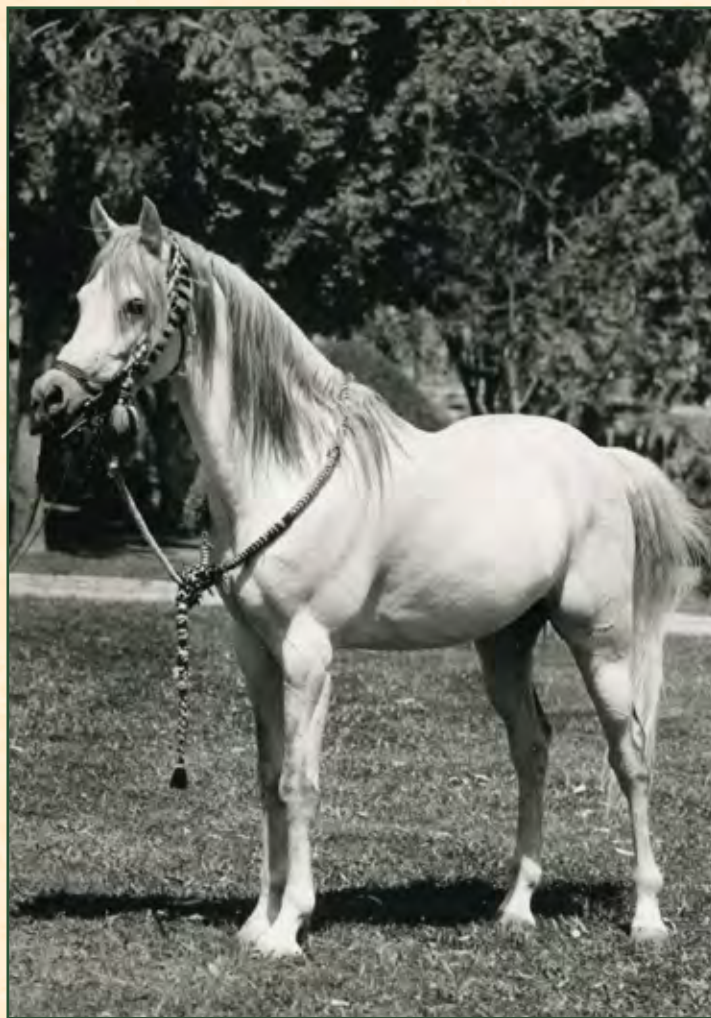
Akhtal (Amrulla x Hagir), a straight Egyptian stallion bred by the EAO and born in 1968. He was especially well-known for his children Morhaf EAO, Taymour EAO, and Ibn Adaweya.