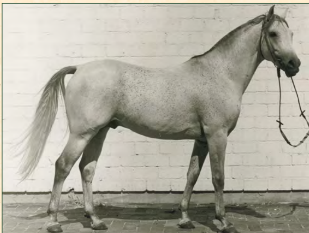
Erika Schiele's stallion El Beshir.