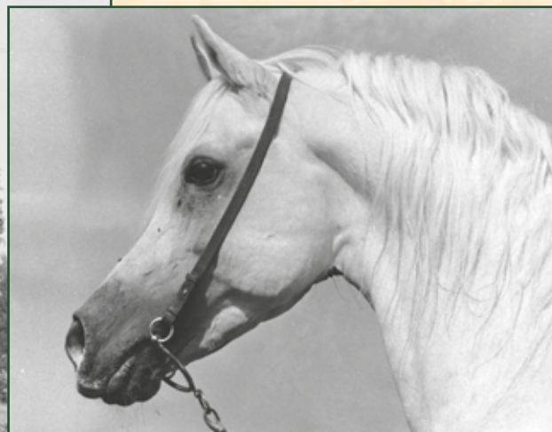
Legendary Ghazal (Nazeer x Bukra), born 1953. Bred by El Zahraa, Cairo, Egypt.