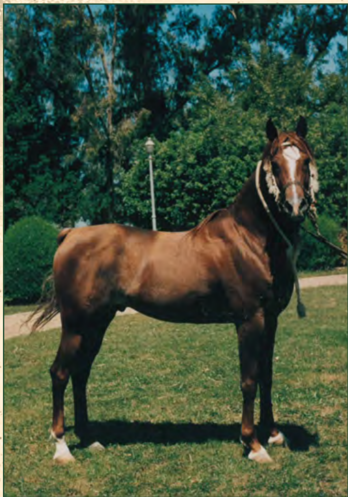
Ibn Sharzada (Anter x Sharzada) in El Zahraa.