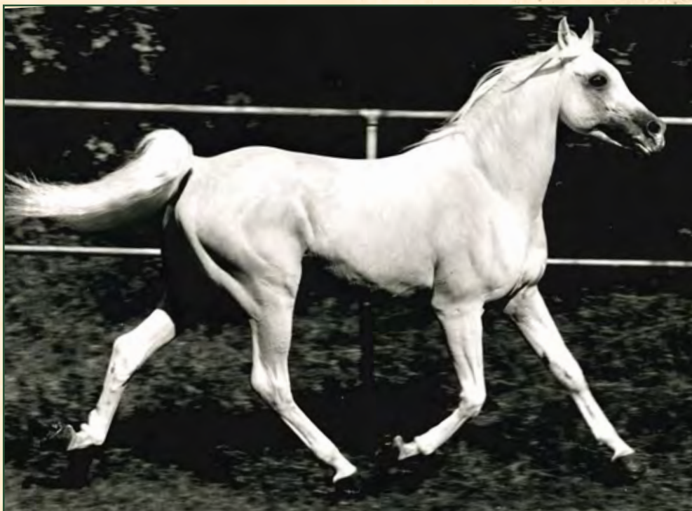
A historical document: Hadban Enzahi (Nazeer x Kamla). He was bred by El Zahraa, Egypt and imported to Germany together with his half-brother Ghazal.